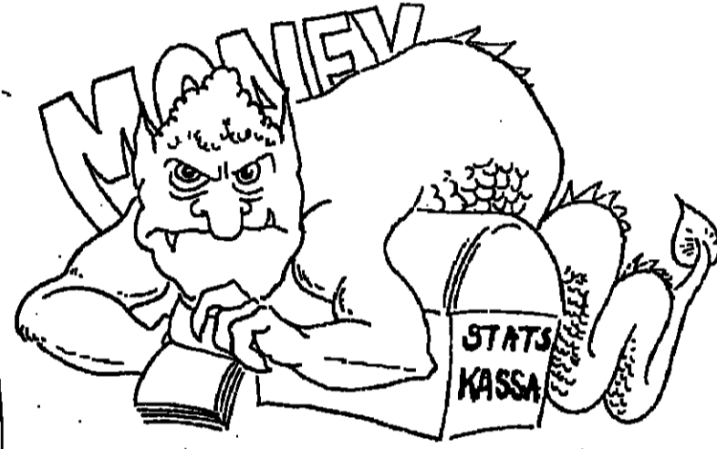
A dragon guards the state coffers against hungry students

JOHANNESBURG Interest is growing rapidly in the use of computers in instruction at South African universities. A pilot project is under way at the University of the Western Cape, which caters for mixed-race students.